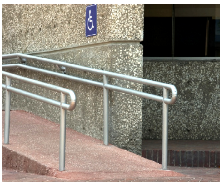
Figure 3 – Needs entry edge contrast.

Learn more about managing slip and fall risks at cna.com/riskcontrol (US) or cnacanada.ca (Canada).