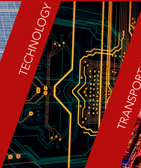
TRANSPORT & LOGISTICS